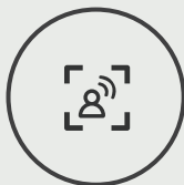
AUTO FRAMING, TRACKING, GESTURE CONTROL