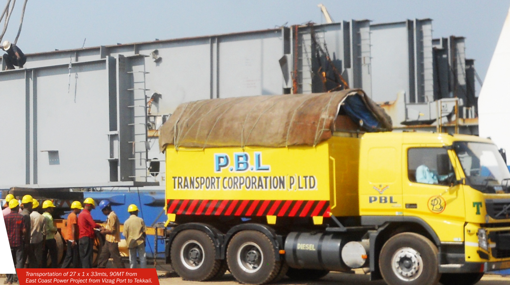
Transportation of 27 x 1 x 33mts, 90MT from East Coast Power Project from Vizag Port to Tekkali.

Our unwavering commitment to excellence has ensured that a fair amount of a business is from repeat orders and regular customers as they are not only satisfied with our services but also have full faith in our capabilities. Hence our large list of clientele includes major Government, Semi-Government, Public Sector Undertakings and MNCs.