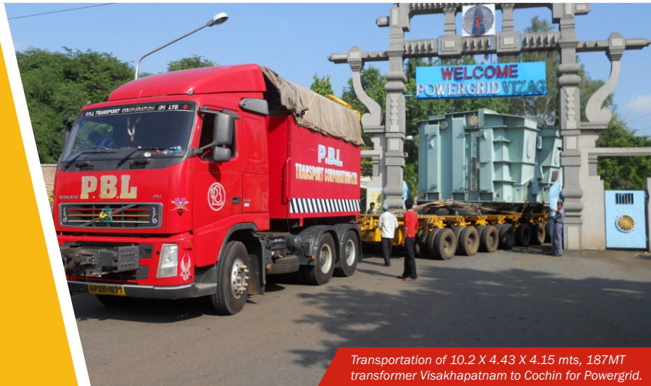
Transportation of 10.2 X 4.43 X 4.15 mts, 187MT transformer Visakhapatnam to Cochin for Powergrid.

PBL is a name which has become synonymous for safe and satisfactory delivery of goods, a familiar name for custom made solutions in the field of transportation and material handling across India. Over the years the PBL Group has evolved and grown exponentially to become an organisation to reckon with. With a rich legacy, a progressive outlook and a consistently superior track record, the Group remains committed to excellence and delivering satisfaction to its customers.