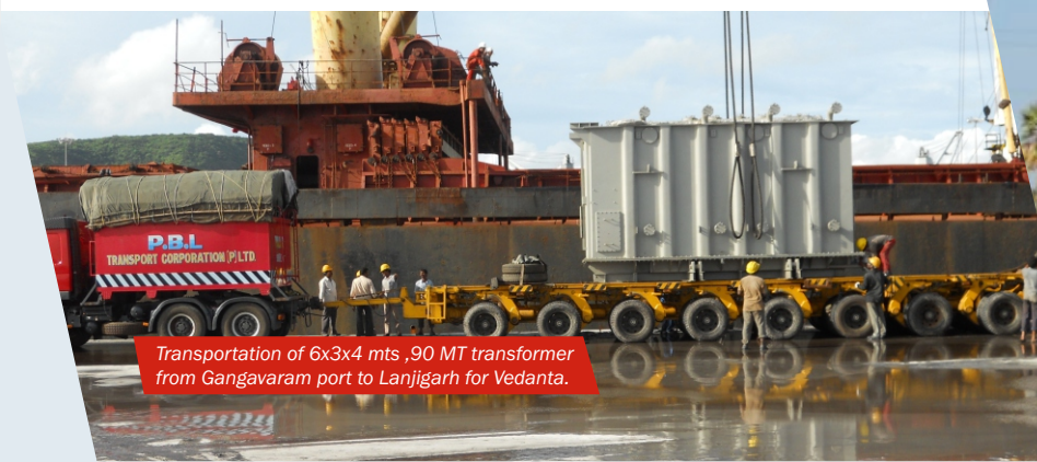
Transportation of 6x3x4 mts ,90 MT transformer from Gangavaram port to Lanjigarh for Vedanta.