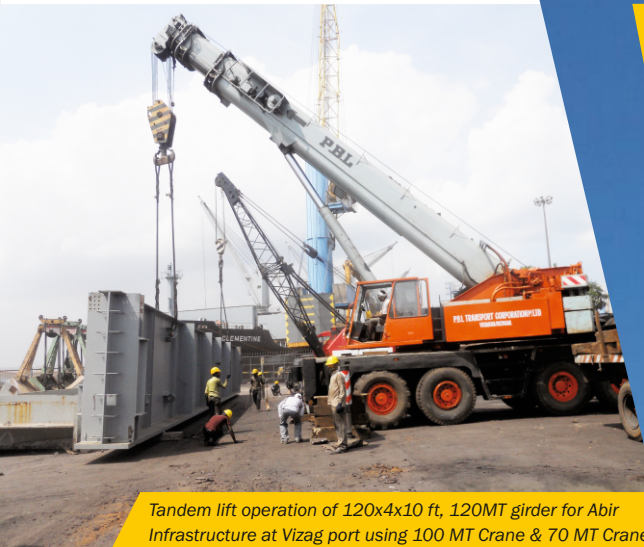
Tandem lift operation of 120x4x10 ft, 120MT girder for Abir Infrastructure at Vizag port using 100 MT Crane & 70 MT Crane

400 MT crane at work in Kanyakumari for Pioneer Wincon. Main boom 46 mts, Luffing Jib 35 mts, Working Radius 25 mts and Lifted weight 22 MT