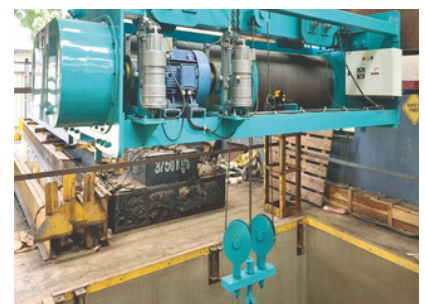
Load Testing Upto 50 Ton