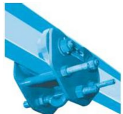
Pull Push Trolley