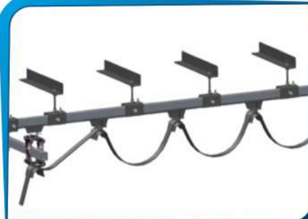
C-RAIL FESTOON SYSTEM