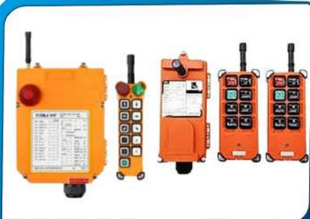
WIRELESS RADIO REMOTE