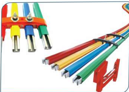
DSL BUS BAR