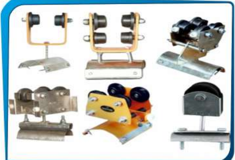
MS, SS & PVC CABLE TROLLEY