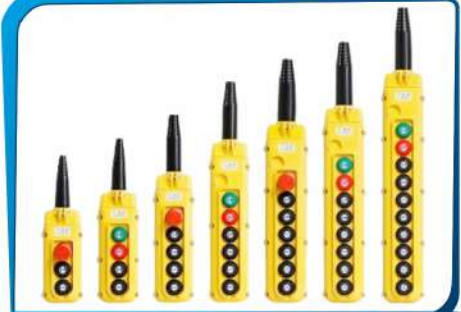
PENDANT PUSH BUTTON