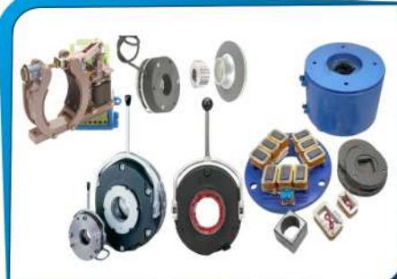
HYDRAULIC THURSTOR CRANE BREAKS