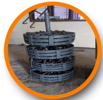
JIGS & FIXTURES