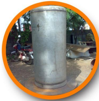
RETORT / QUENCHING TANKS